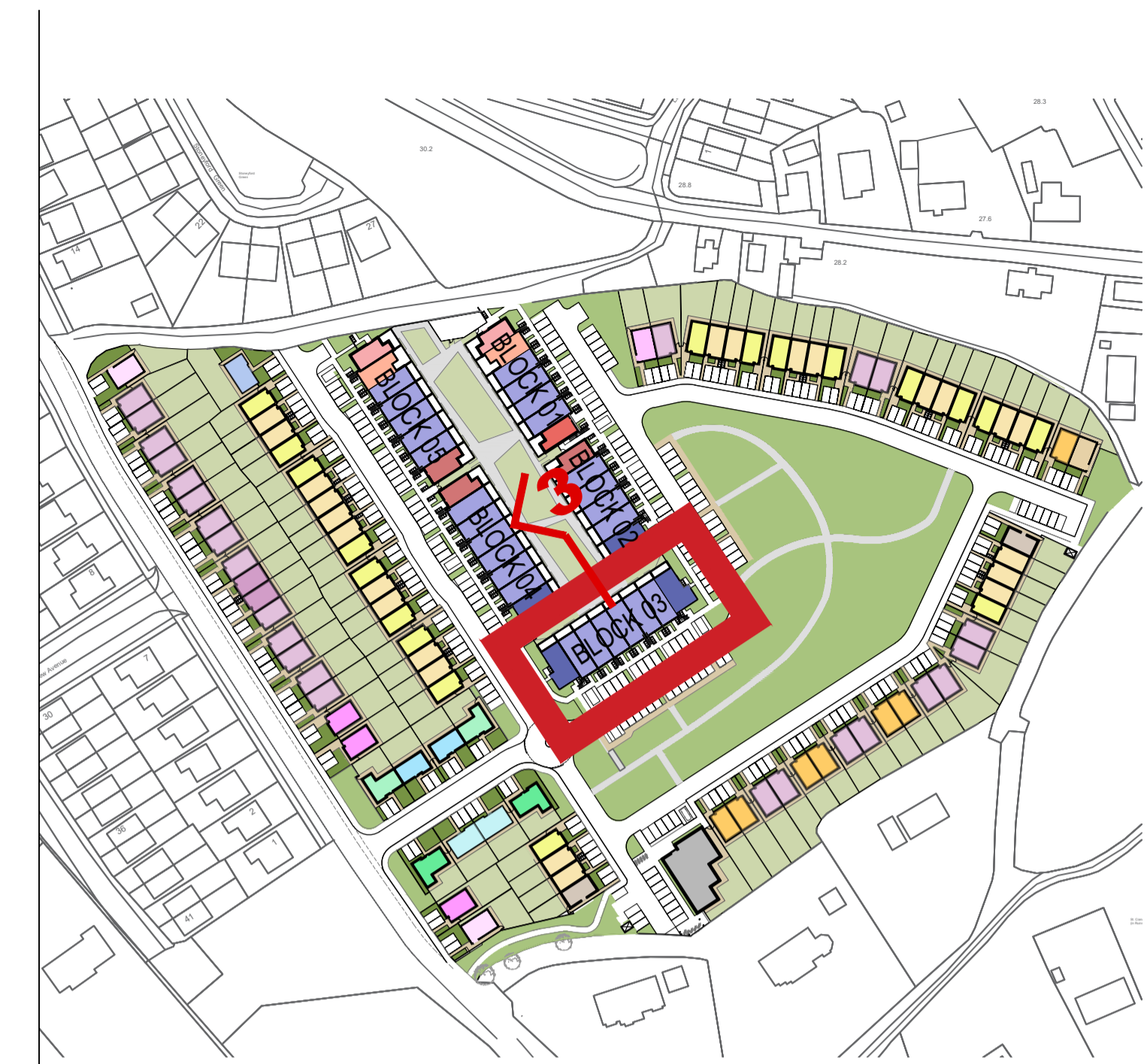
KEY PLAN (NOT TO SCALE)